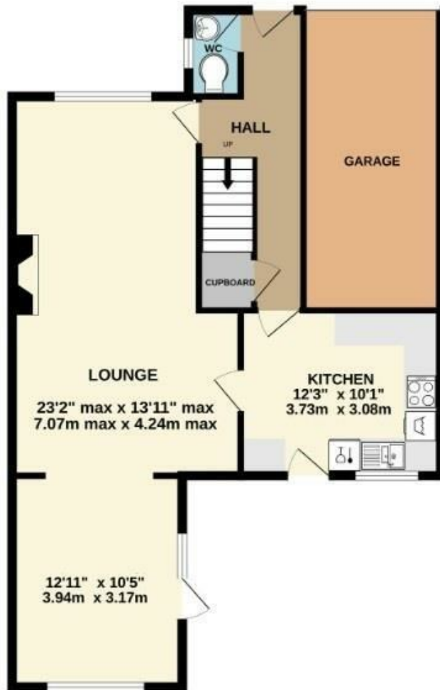
GROUND FLOOR 817 sq.ft. (75.9 sq.m.) approx.